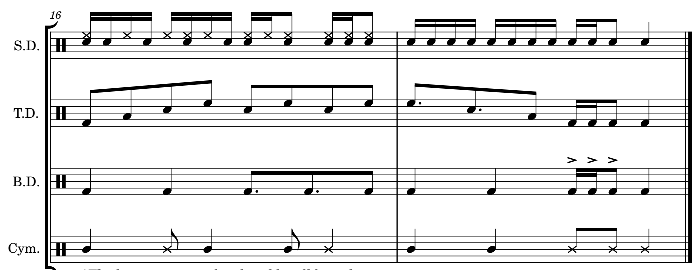
*The bass 4 part can be played by all bass drums